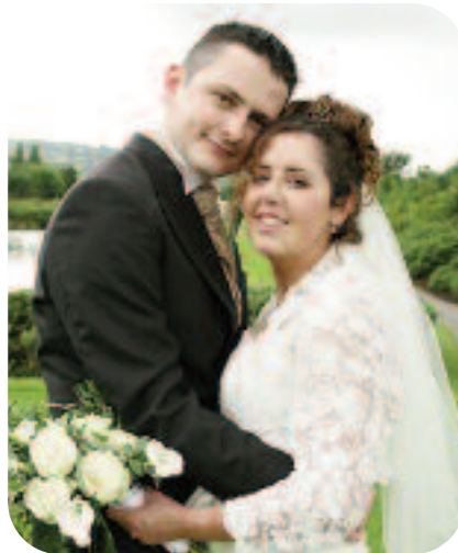
THE NEWLY WEDS