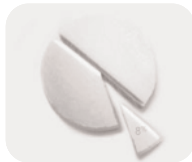
THE PRICE OF A PILL?