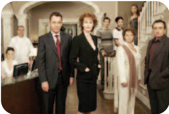
The Cast of RTEs the Clinic