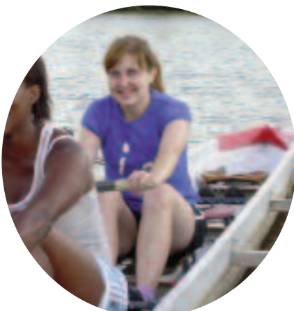
Working hard at college