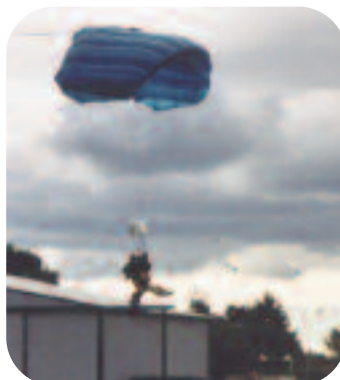
The new sport of shead jumping