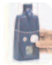
The I-neb by Respirationics

As it currently stands and I would say for the foreseeable future if you want an Aeronex Go or e-Flow Rapid you will have to buy one yourself, as there are not approved for use in meds such as Tobramycin so clinics can't prescribe them, in turn the HSE won't pay for them. If you want an I-neb you can only get one if you are on Promixin which the HSE also won't pay for!