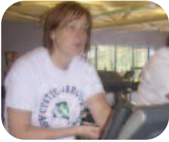
Training for the NY marathon