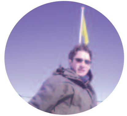
Enjoying the winter sun in France